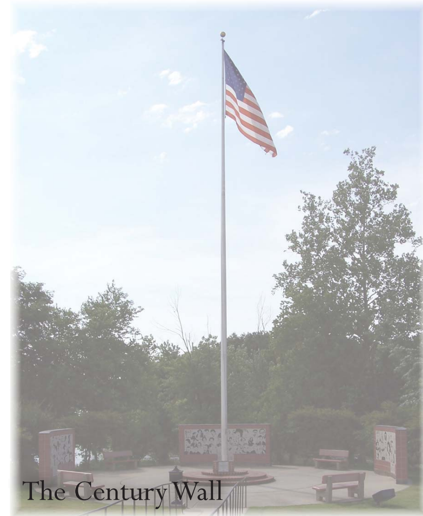
The Century Wall

noticed, but not unfelt, and to those who have made us consider whether the ways in which we are different are really more important than the ways in which we are alike. It places before us men and women who, in all the rich and beautiful tapestry that is America, helped to shape this nation in the 20th Century." ~ JFZ